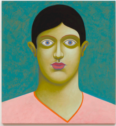
Nicolas Party, Portrait, 2017.

THE 15 NEW YORK SHOWS YOU NEED TO SEE THIS OCTOBER