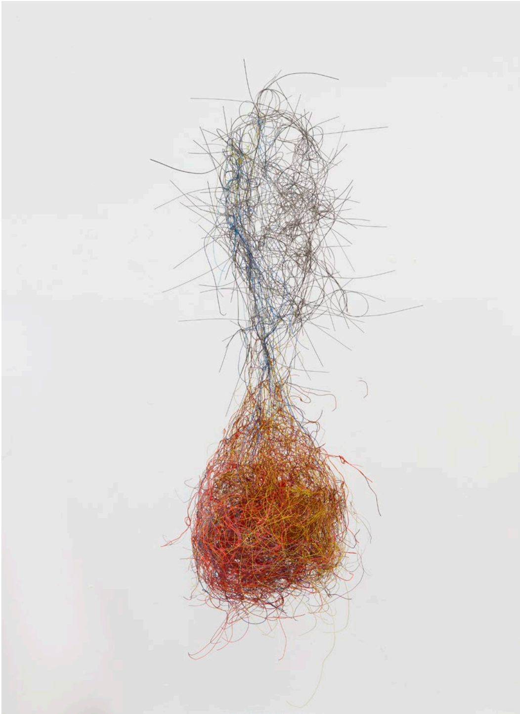
Alan Saret Regnum Solae , 1986 Stainless steel, Teflon coated wire and magnet wire 75 × 36 × 33 inches; 190.5 × 91.4 × 83.8 cm ASA-86-001