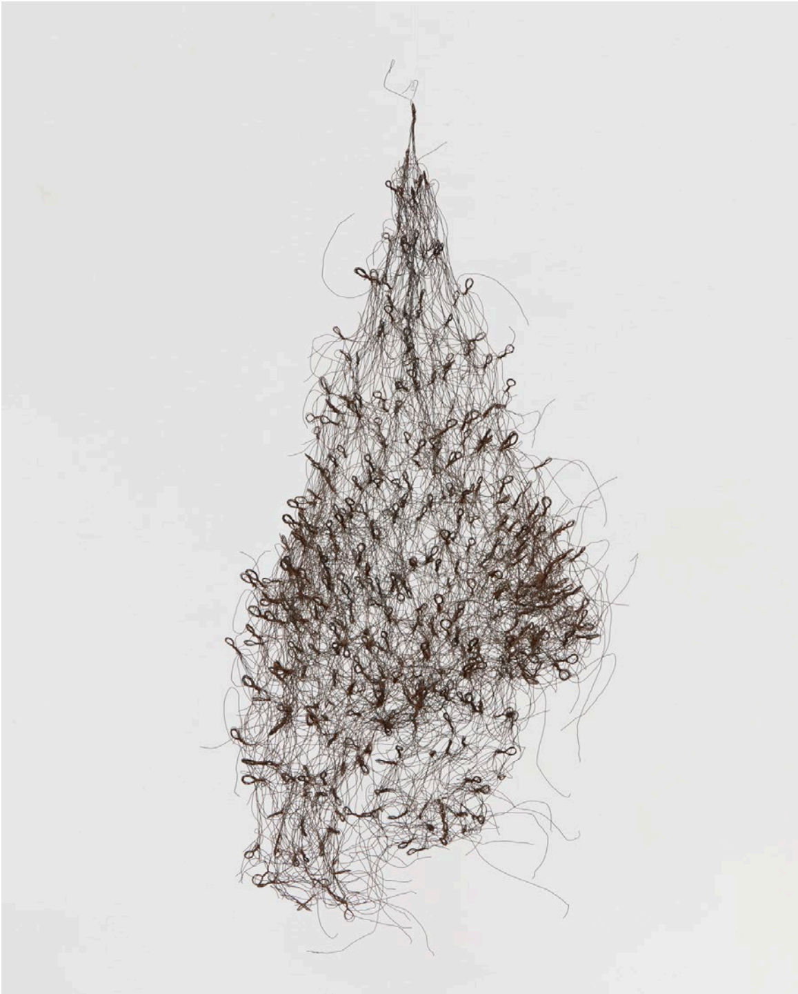
Alan Saret Cone Cap and Crown , 2010 Copper wire 41 × 22 × 24 inches; 104.1 × 55.9 × 61 cm ASA-10-001