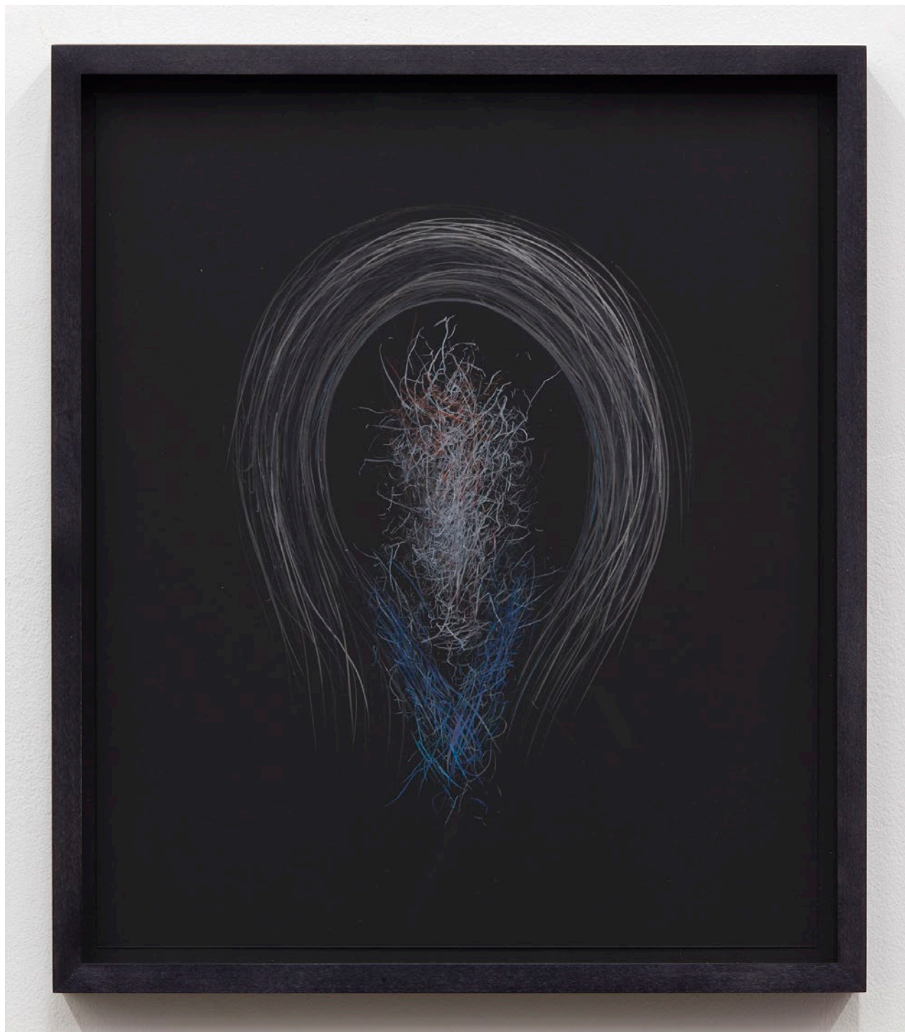
Alan Saret Blue Vee Ensoulment , 2008 Colored pencil on black paper 14½ × 12 inches; 36.2 × 30.5 cm ASA-08-002