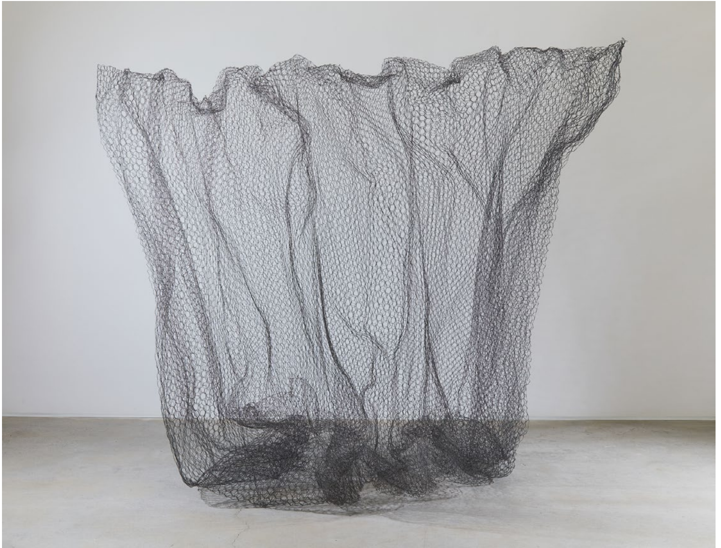
Alan Saret Zinc Cloud , 1967/1990 Galvanized steel hex netting 66 × 72 × 84 inches; 167.6 × 182.9 × 213.4 cm ASA-68-013