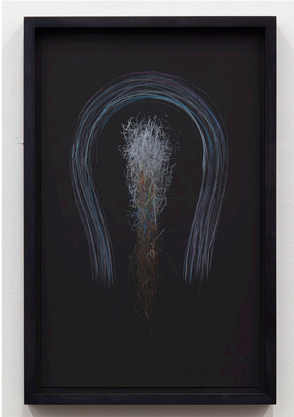
Alan Saret Ensouled in Nut's Parlor , 2008 Colored pencil on black paper 16¼ × 10 inches; 41.3 × 25.4 cm ASA-08-004