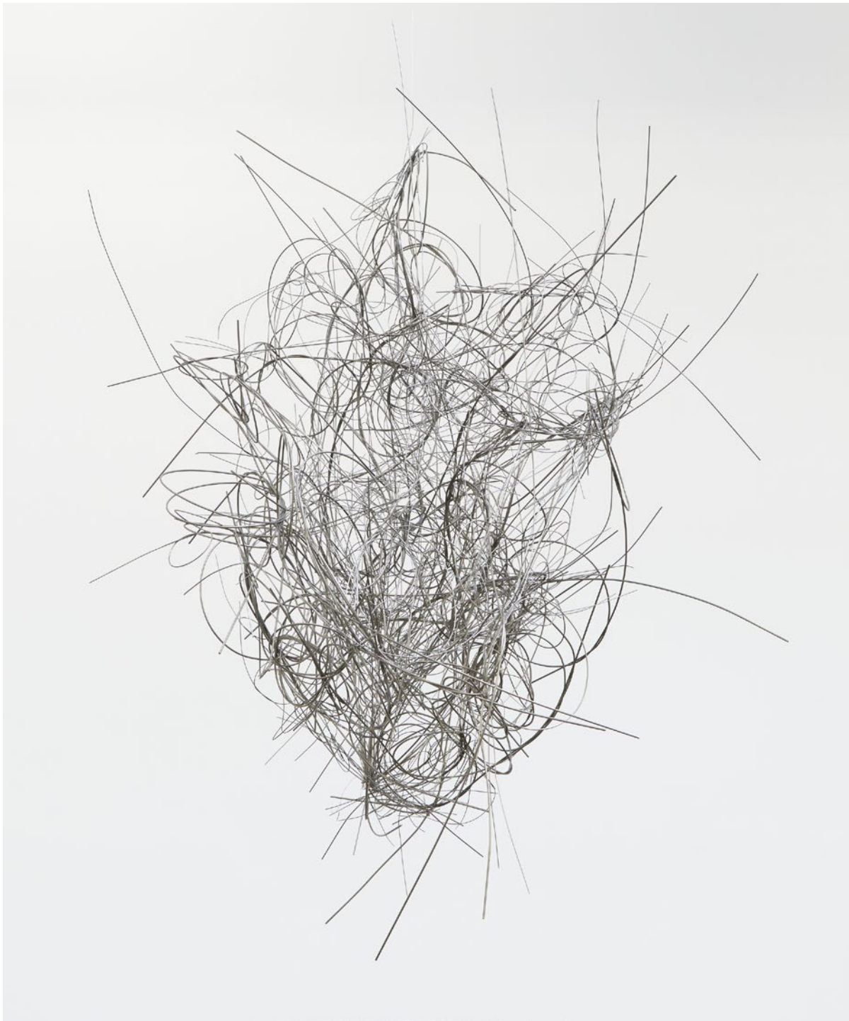
Alan Saret Spring Breath Be , 2012 Tempered stainless steel wire 56 × 32 × 36 inches; 142.2 × 81.3 × 91.4 cm ASA-12-001