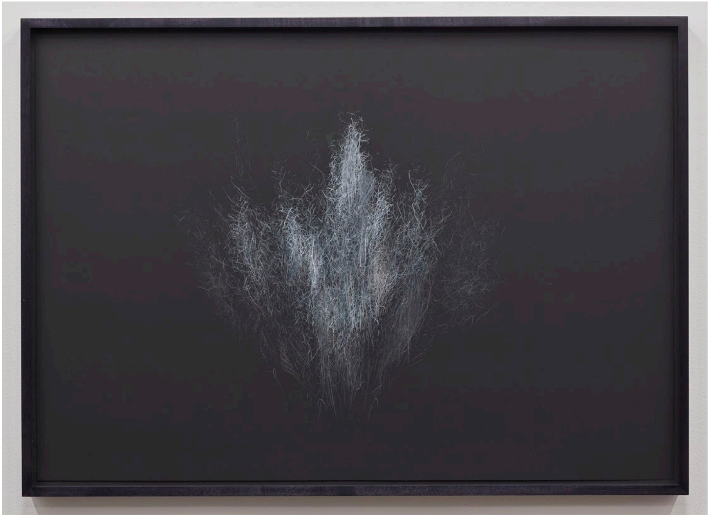
Alan Saret Storm Pass Ensoulment , 2008 Colored pencil on black paper 28½ × 40 inches; 72.4 × 101.6 cm ASA-08-007