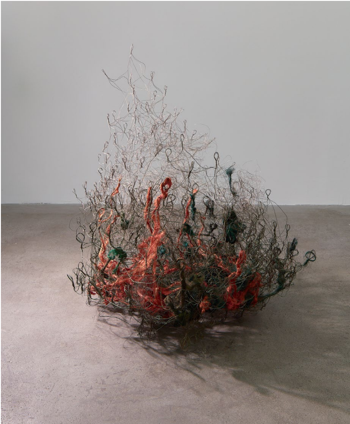
Alan Saret Soaring Sail Mountain , 1988 Stainless steel and magnet wire 44 × 33 × 35 inches; 111.8 × 83.8 × 88.9 cm ASA-88-002