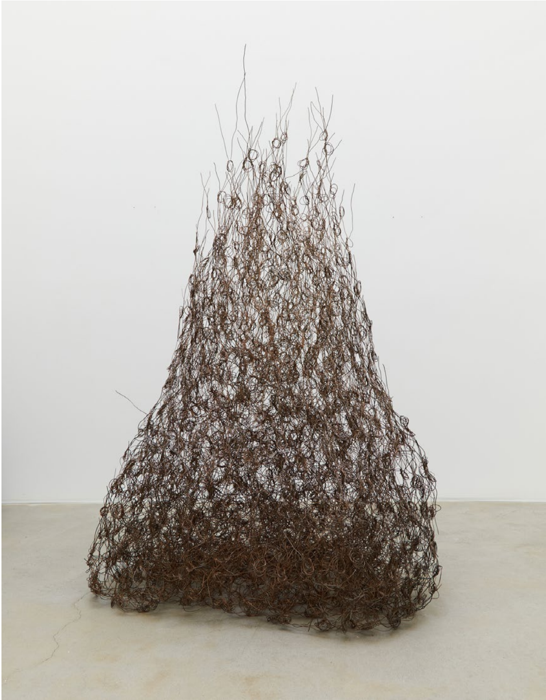
Alan Saret Blazing Be , 2008 Copper wire 84 × 53 × 36 inches; 213.4 × 134.6 × 91.4 cm ASA-08-012