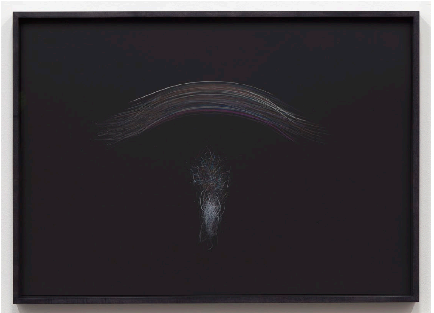
Alan Saret Core Crux Ensoulment , 2008 Colored pencil on black paper 28 × 40 inches; 71.1 × 101.6 cm ASA-08-005