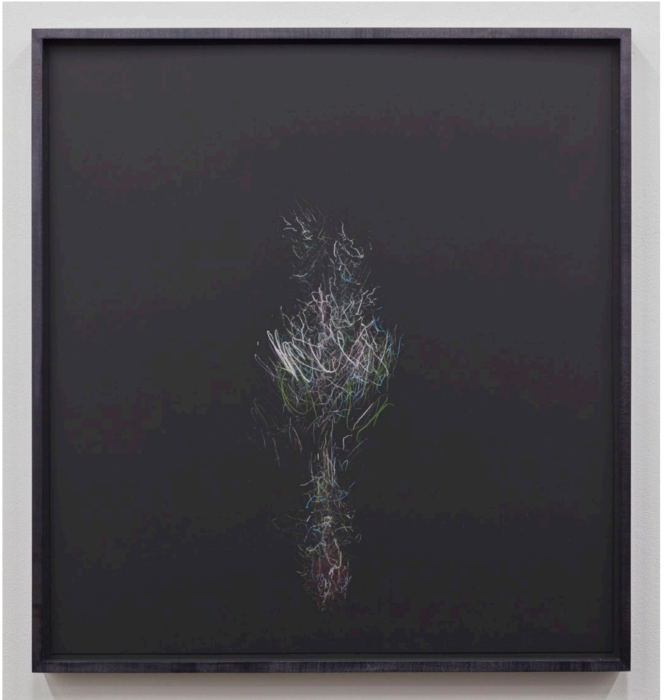
Alan Saret Capridance Ensoulment , 2008 Colored pencil on black paper 27 \frac{3}{4} × 25 \frac{3}{4} inches; 70.5 × 65.4 cm ASA-08-001