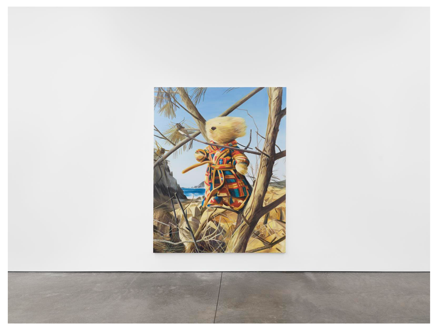
Ulala Imai. ATLANTIS, 2024. Oil on canvas. 891/2 × 715/8 in. (227.33 × 181.93 cm).